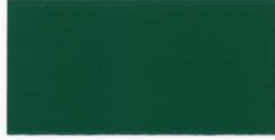
GE18 Forest Green